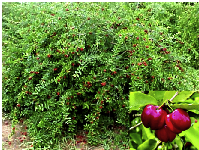
Fig. 1. Fruits of acerola ( Malpighia emarginata DC).

The total phenolic content in acerola juice was measured using a modified Folin–Ciocalteu method. 15 with gallic acid as the standard, and the results were expressed as galic acid equivalents (GAE) mg/100 g FW.